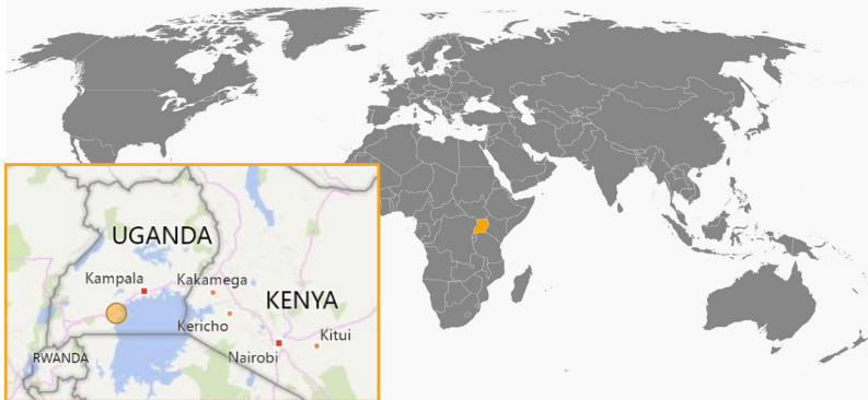
In the field, Masaka District, central region Uganda

www.agriterra.org/movies/uganda_kibinge_coffee_cooperative_2017